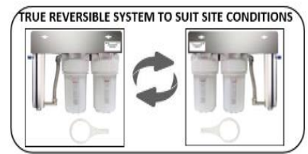
TRUE REVERSIBLE DESIGN